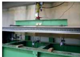
Knauf cold frame with thermal stud being structurally tested

Development of the systems for maximum structural performance involved a combination of theoretical calculation in accordance with the Eurocodes and structural testing of the systems. The structural testing enabled SCI to produce enhancement factors to apply to the theoretical design capacity which takes account of the panel acting compositely as a system rather than individual components.